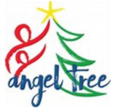
Christmas Tree Angels

The Salvation Army has given us 20 tags for children ranging in age from 8 months to 12 years. These children, like our own little ones, have written their Christmas wish lists; and with our help, their dreams will come true.